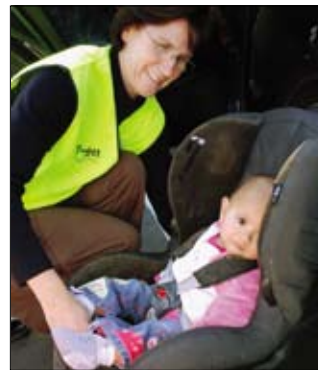
Free child seat clinics